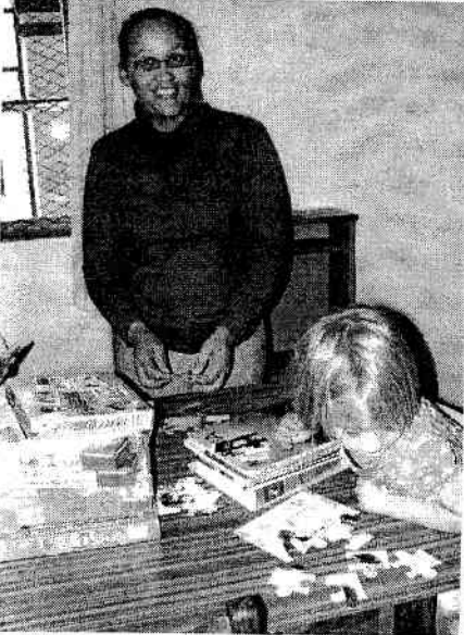
CHILDREN PLAYING WITH THEIR NEW TOYS